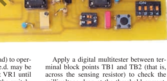
Fig.2 (above). Printed circuit board component layout and full-size copper foil master. The completed board is shown in the photograph.

Allow the external circuit (load) to operate normally. The buzzer and l.e.d. may be operating already. Adjust preset VR1 until the critical point is reached. If the switching point is not sharp (the buzzer "chirps" at the threshold value), it may be necessary to improve the degree of smoothing of the supply. In most cases, however, it will not matter.